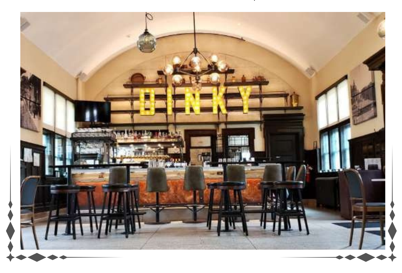
To host an event at The Dinky Bar & Kitchen requires a buy-out of the restaurant, which features a standing cocktail reception for up to 80 guests. This includes indoor & outdoor space.