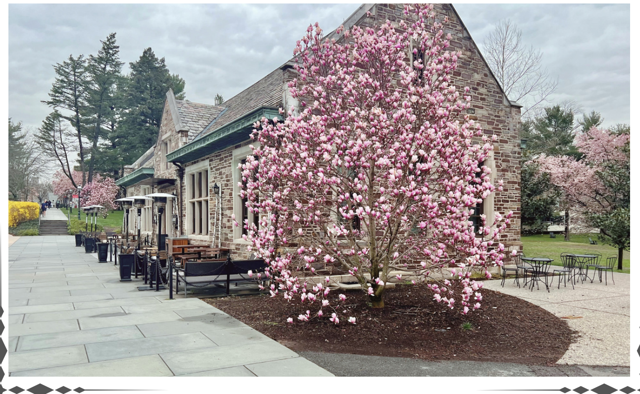
This space can be included in the buyout